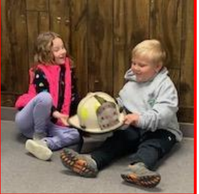
Kindergarten trip to the